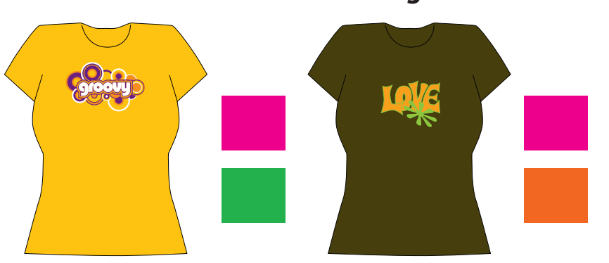
Item Code: SFZ-GROOVY-WItem Code: SFZ-LOVE-WColor: Gold, Fushia, LimeColor: Brown, Fushia, Orange